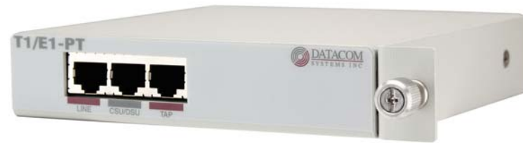
T1/E1-PT with thumbscrew bracket to mount in RMC-3 rack mount