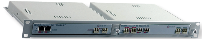
Optional 2-Unit Rack Mount

The Copper Gigabit Regeneration Tap provides easy 24 x 7 access to your Gigabit Ethernet segments. Three devices, such as intrusion detection systems, protocol analyzers, or probes can access the same segment at a single point, eliminating contention for network links. With redundant power supply and fault tolerant design, network performance and integrity will not be affected by power loss.